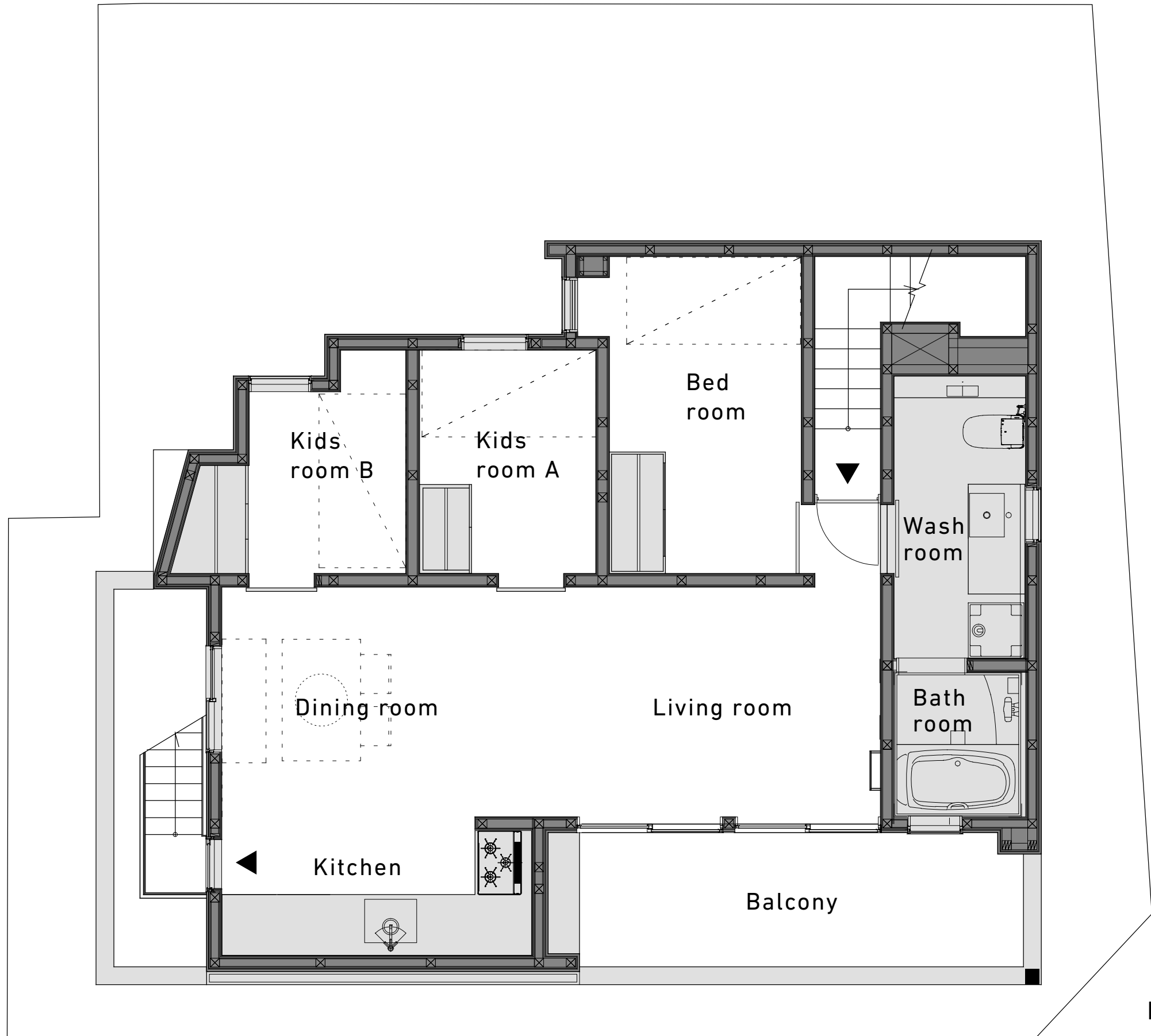
HOUSE - NI / 3F 64.02m 2 / S=1:50